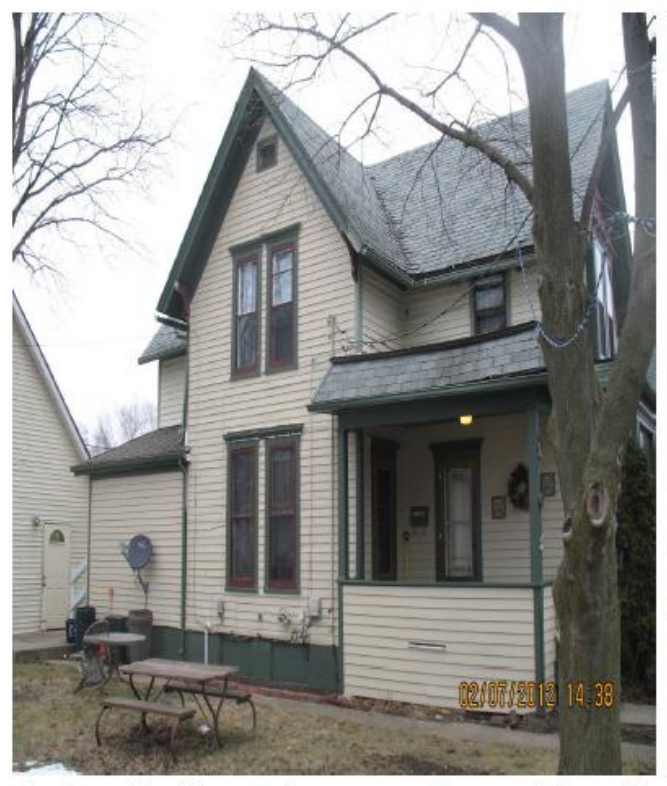
Southern side of house where upper and lower windows will be replaces with proposed new windows.