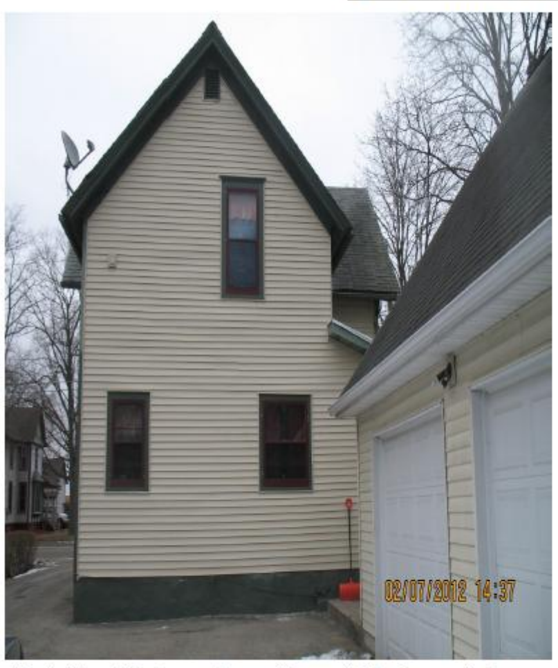
West side of the house ( rear of house). The lower window on left-hand side is location of window replacement.