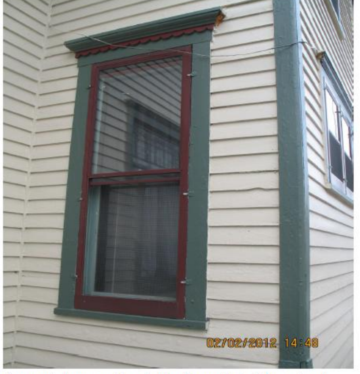
Lower window on northeast side of house that will be replaced.