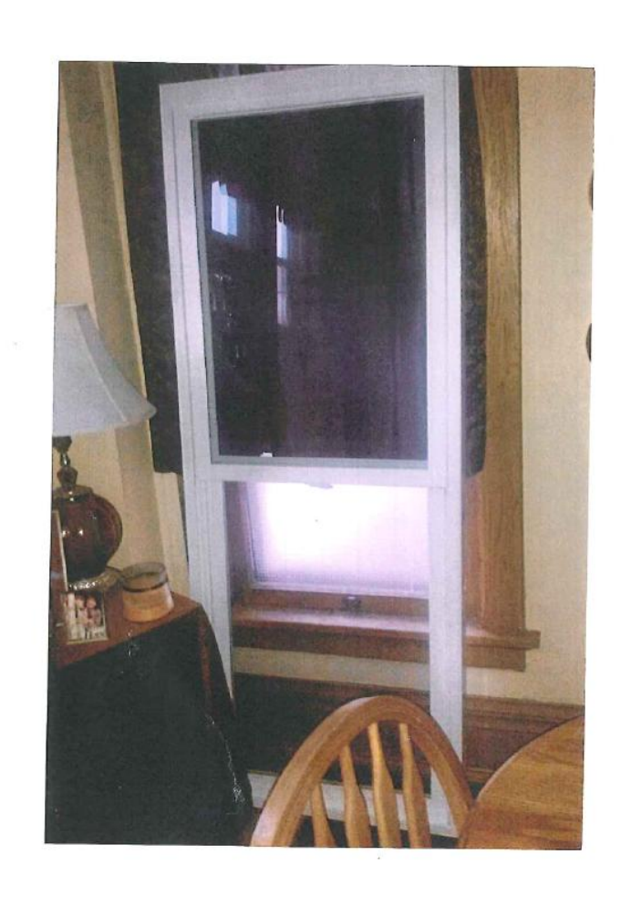
Figure 5: Photograph of Proposed Vinyl Window Replacement Submitted By Applicant