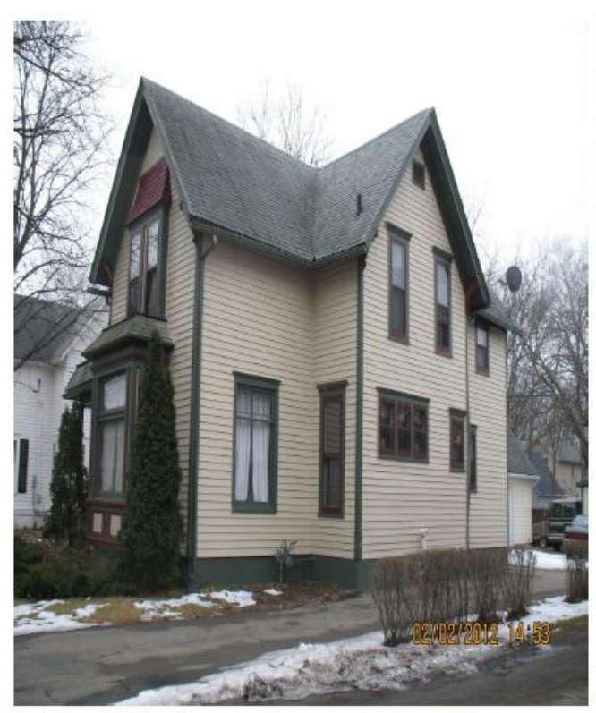
Northeast side of house where one window will be replaced.