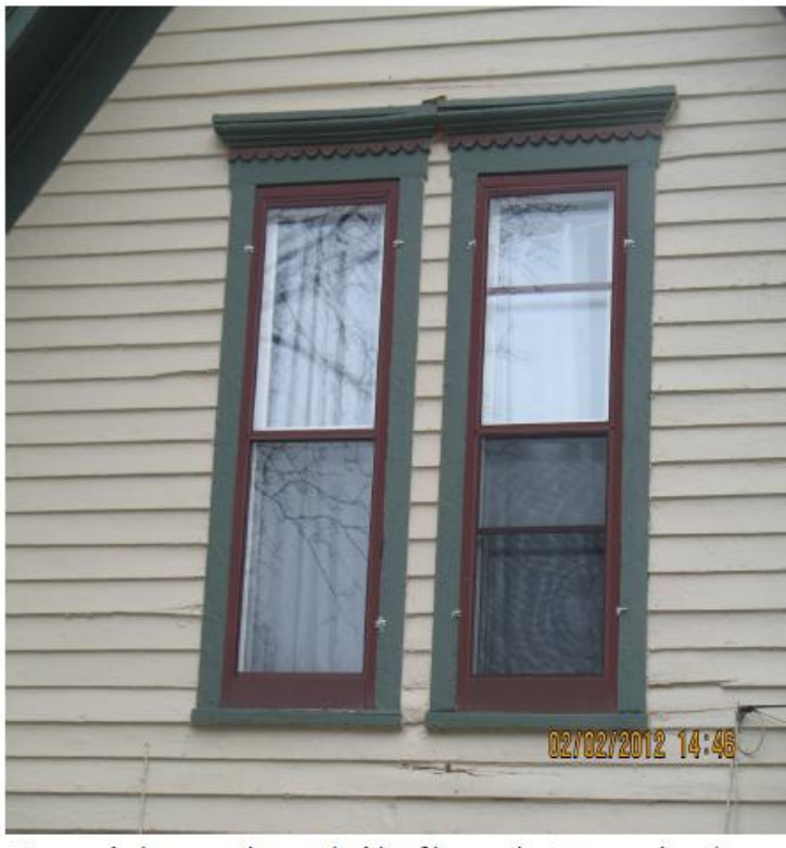
Upper windows on the south side of house that were replaced without a COA or Building Permit.