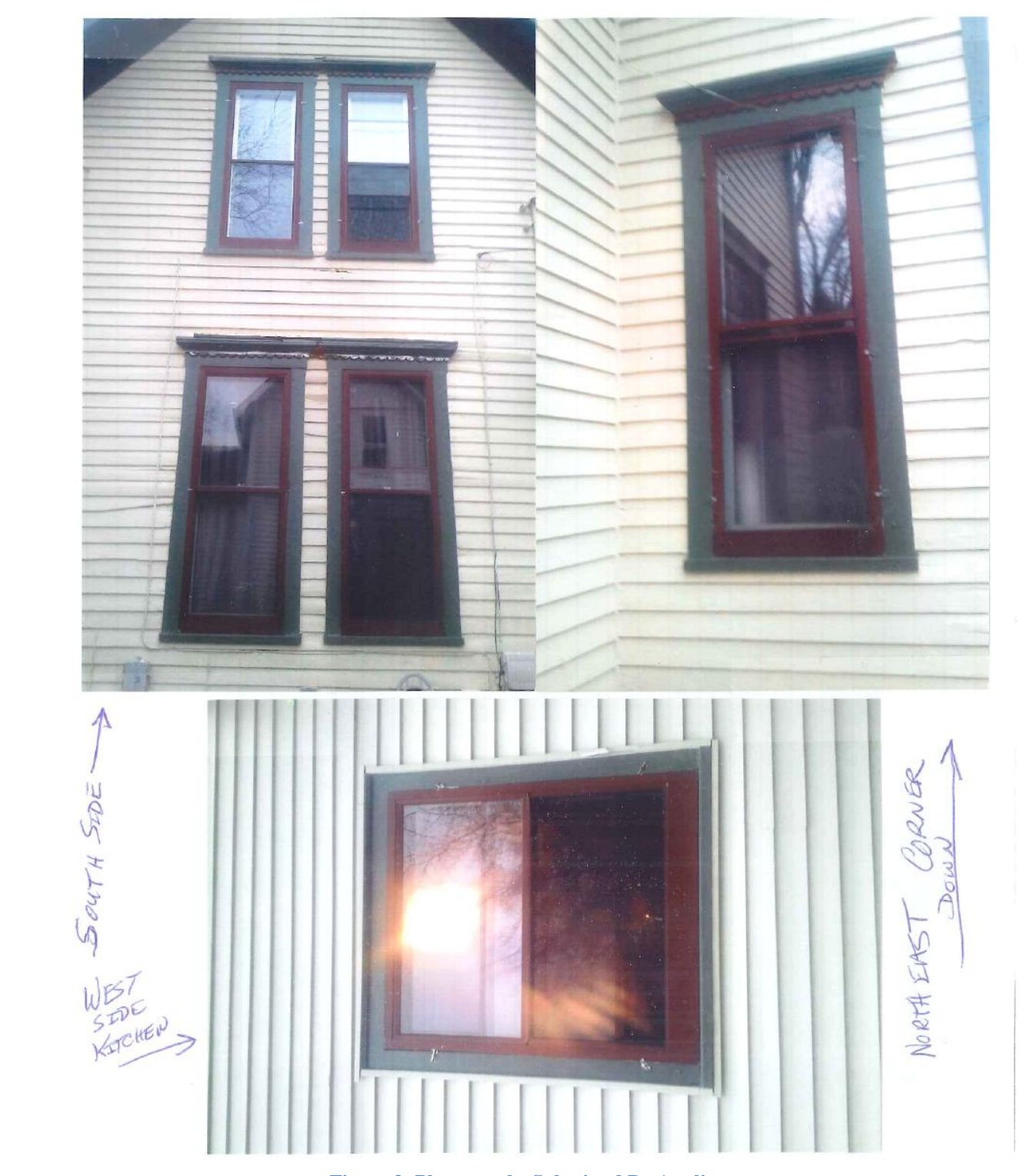
Figure 3: Photographs Submitted By Applicant