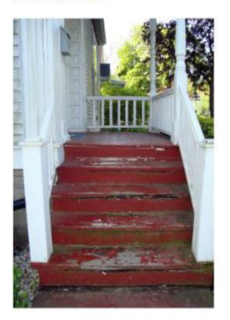
FRONT PORCH (LEFT: Step entry from driveway; RIGHT: detail of spindles)