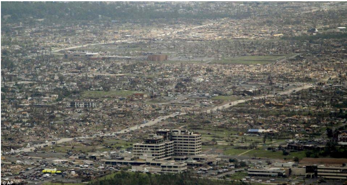
(Joplin Missouri-May 22, 2011 an EF-5 tornado with winds over 200 mph strikes the town about the size of Wausau. 160 people are killed and more than 1000 injured)