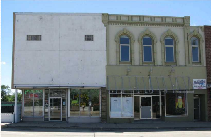
Current image of 110 W. Grand Ave.