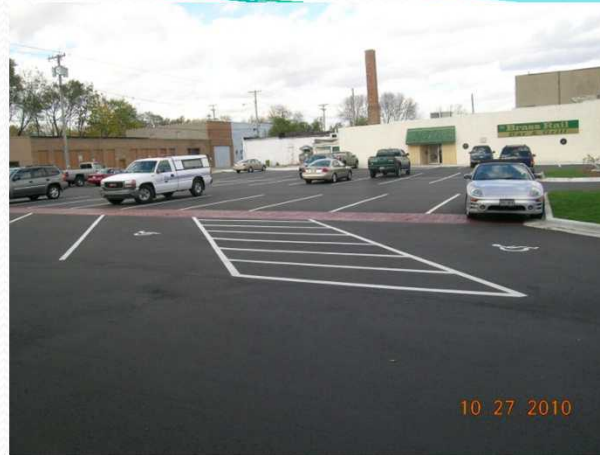
4 th Street Parking Lot – pre and post construction