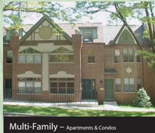
D Multi-Family – Apartments & Condos