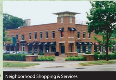
E Neighborhood Shopping & Services