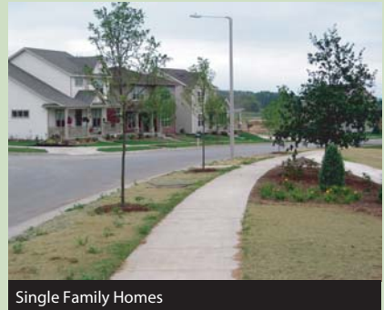
A Single Family Homes