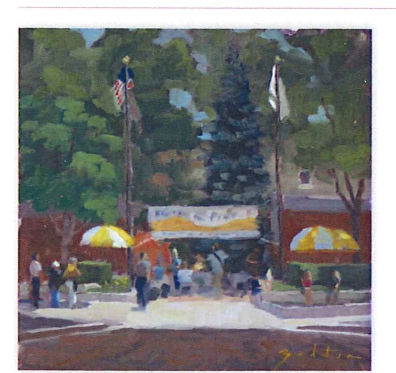
Mark Zelten, Fridays in the Park

A Little Night Music will be held at two separate locations and during two different times, all on one evening.