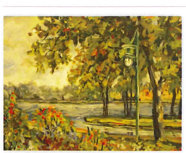
Farmers' Market