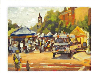
Jason Prigge, Beloit Farmers' Market