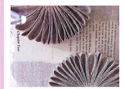
Make and Take Workshop at The Villager