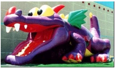
This event is organized by The City of Beloit, Department of Public Works

If you have any questions, please feel free to call (608) 364-2888