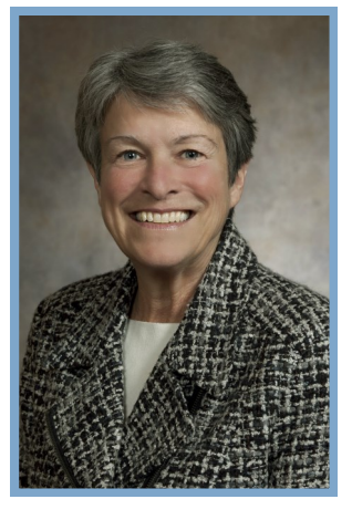
Sen. Janis Ringhand Senate District 15 Economic Development & Commerce Committee