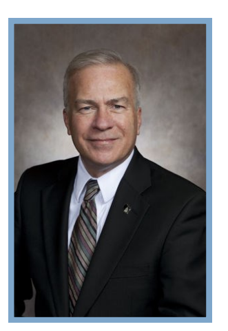
Sen. Stephen Nass Senate District 11 Education Committee