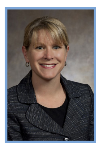
Rep. Amy Loudenbeck Assembly District 31 Joint Finance Committee