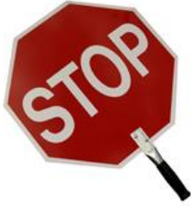
Figure 6-Stop Paddle

The School District has over 15 crossing guards stationed throughout the City to help students safely cross the street. All of the School District crossing guards have a stop paddle to use when guiding students across the street. Drivers must stop if they are directed by the school crossing guard to stop. Drivers shall stop their vehicle and remain stopped until the school crossing guard directs the drivers to proceed. The fine for failure to stop for an adult crossing guard is $188.00.