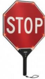
Figure 7-Flashing Stop Paddle

Figure 6 - Typical stop paddle used by crossing guards within Beloit