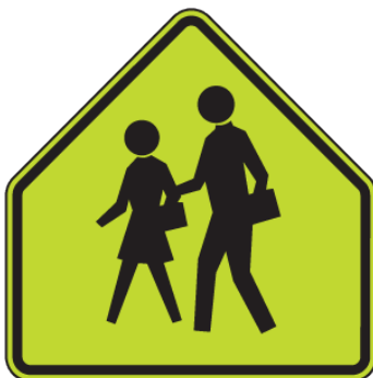
Figure 1 - School Zone Sign is used to alert drivers to that they are entering a school zone area

School signs are typically yellow or fluorescent yellow-green in color. The shape of school signs is typically a pentagon (pointed up) or a large rectangle indicating the speed limit information. Below are examples of typical school signage used within the City of Beloit.