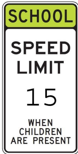
Figure 2 - School Speed Limit Sign is used to alert drivers to a change in the speed limit within the school zone area. In Wisconsin, the fixed speed limit for school zones is 15 MPH.