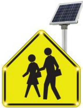
Figure 5 -Flashing School Crossing Sign

Figure 5 - Flashing School Crossing Sign (Installed on Cranston Road)-sign will flash when activated by pedestrian. Used as an additional warning to drivers to indicate a pedestrian is about to enter the school crosswalk.