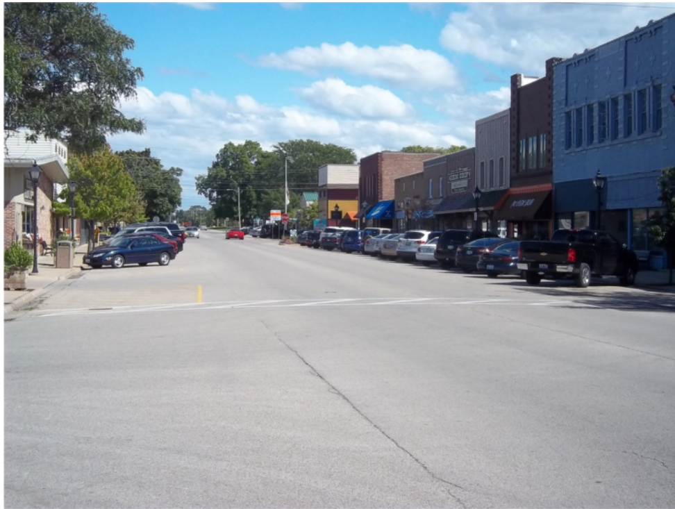
W. Main Street Located in Downtown Rockton, Illinois