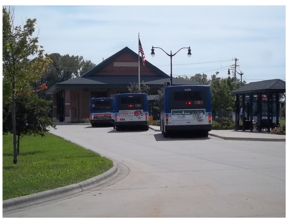
Beloit Transit System (BTS) Transfer Facility built in 2010. A Transit Development Plan is underway in 2014 and is proposed to be completed in 2015. See Work Plan Element 500 for more information.

2015 UNIFIED PLANNING WORK PROGRAM (UPWP) NOVEMBER 10, 2014