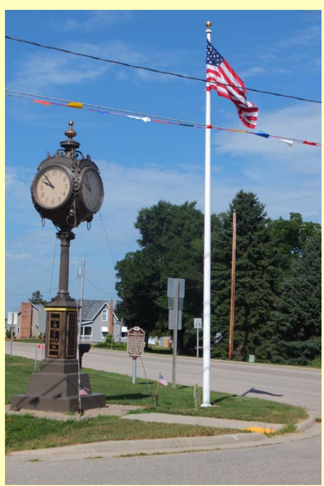
Town of Turtle Memorial Clock

October 8, 2013 Version - Adopted October 28, 2013