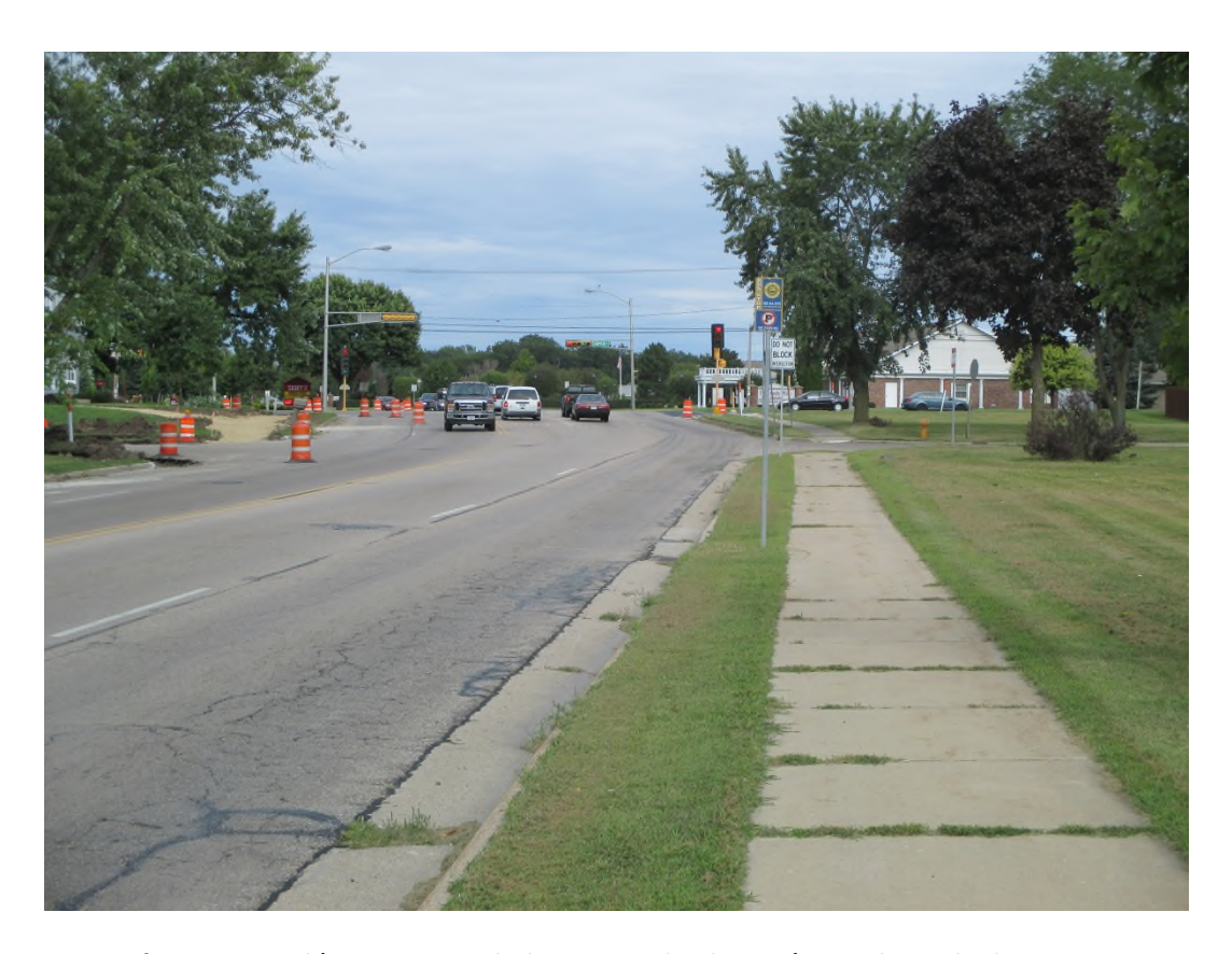
View of Cranston Road (intersection with Shopiere Road in distance). Corridor study plan planned in 2018.

2018 UNIFIED PLANNING WORK PROGRAM (UPWP)