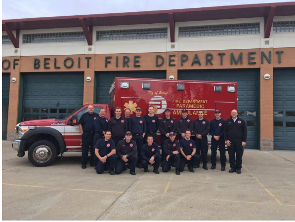
City of Beloit Fire Department Paramedics

The Beloit City Council will issue a proclamation at their May 18th meeting proclaiming the week of May 17 - 23, 2020 as Emergency Medical Services Week in the City of Beloit. Members of the Emergency Medical Services teams engage in thousands of hours of specialized training and continuing education to enhance their lifesaving skills. This year's theme is "Ready Today. Preparing for Tomorrow."