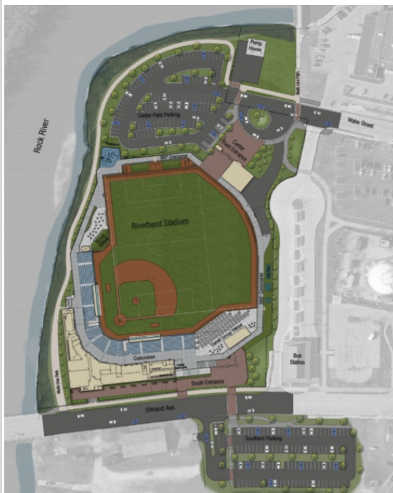
Riverbend Stadium Planned Unit Development