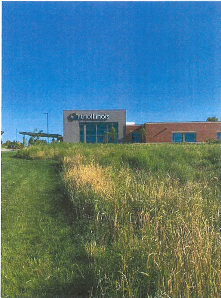
Figure 1 - Low-profile Prairie After 3 Years

PART OF LOT 4, MORGAN FARM, IN PART OF THE NORTHEAST 1/4 OF THE SOUTHWEST 1/4, AND IN PART OF THE NORTHWEST 1/4 OF THE SOUTHEAST 1/4 OF SECTION 20, TOWNSHIP 1 NORTH, RANGE 13 EAST OF THE 4TH P.M., CITY OF BELOIT, COUNTY OF ROCK, STATE OF WISCONSIN, DESCRIBED AS FOLLOWS: BEGINNING AT A POINT IN THE NORTH AND SOUTH CENTERLINE OF SAID SECTION 20, 1654 FEET N. 1° 07' E. FROM THE SOUTH 1/4 CORNER OF SAID SECTION; THENCE S. 57° 42' W. 176.9 FEET TO AN IRON PIPE; THENCE N. 13° 33' W., ALONG THE EAST LINE OF LAND DEEDED TO HIRAM MORGAN, 511 FEET MORE OR LESS TO THE CENTERLINE OF TURTLE CREEK; THENCE NORTHERLY UPSTREAM, ALONG THE CENTERLINE OF TURTLE CREEK, 285 FEET MORE OR LESS; THENCE N. 83° 36' E. 317 FEET MORE OR LESS TO AN IRON PIPE; THENCE S. 61° 15' E. 293.45 FEET TO AN IRON PIPE; THENCE S. 29° 40 2/3' W. 329.2 FEET TO AN IRON PIN; THENCE S. 32° 18' E. 120.26 FEET TO AN IRON PIPE; THENCE S. 57° 42' W. 304.88 FEET TO AN IRON PIPE AT THE PLACE OF BEGINNING.