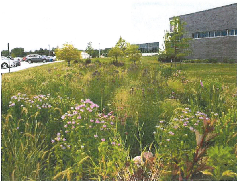
Figure 3 - Bio-swale and Wet-bottom Plantings - 2 Years After Installation.