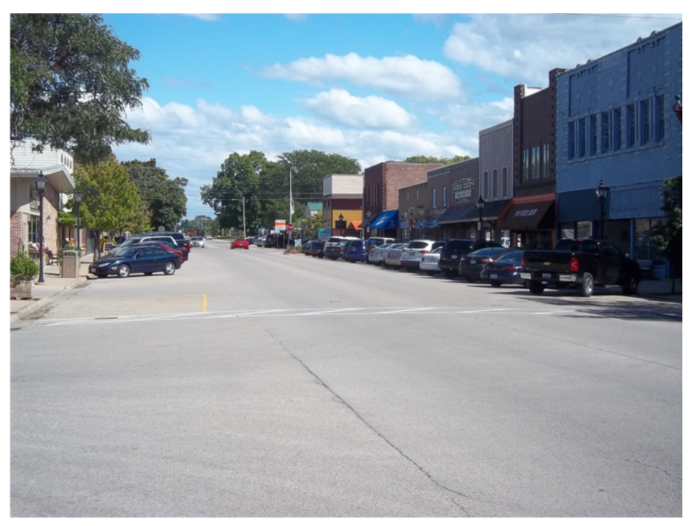
W. Main Street Located in Downtown Rockton, Illinois