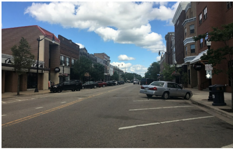
Main Street Bounceback Grant Applications Due Dec. 31!