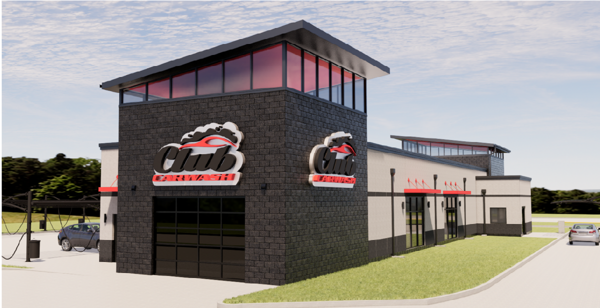
CLUB CAR WASH RENDERING