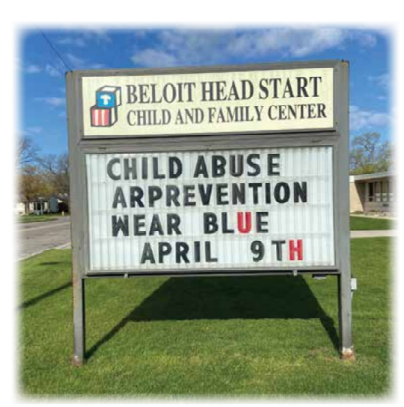
Remove header cabinet and reader board and scrap

INSTALLATION: Remove the existing cabinet and manual reader board from sign and scrap. Prep and paint existing support poles, install new cabinets and EMC's on the existing support poles