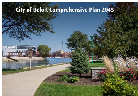
City of Beloit Comprehensive Plan 2045

https://beloitselfreport.azurewebsites.net/ to directly access the tool. A link is available on www.beloitwi.gov/police .