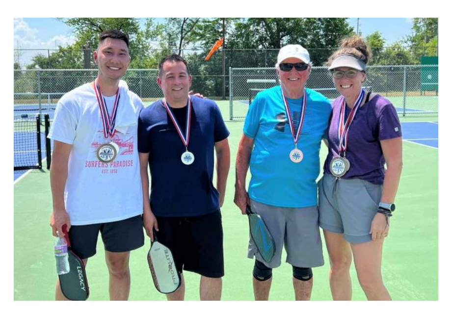
July 4, 2023, Pickleball Tournament at Wootton Park.

Provide and maintain a vibrant community to work, live, and play within a sustainability framework that creates environmental, economic, and social opportunities to ensure the long-term viability of the community for current and future generations.