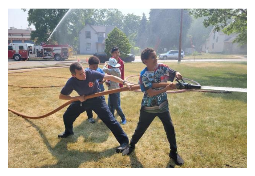
The City of Beloit Police and Fire Departments helped lead School District of Beloit summer school classes to introduce middle school students to careers in public service.

A high performing organization is one with a common sense of purpose, constant improvement, taps into employee talent and innovation, recognizes leadership at all levels, and is representative of the community we serve.