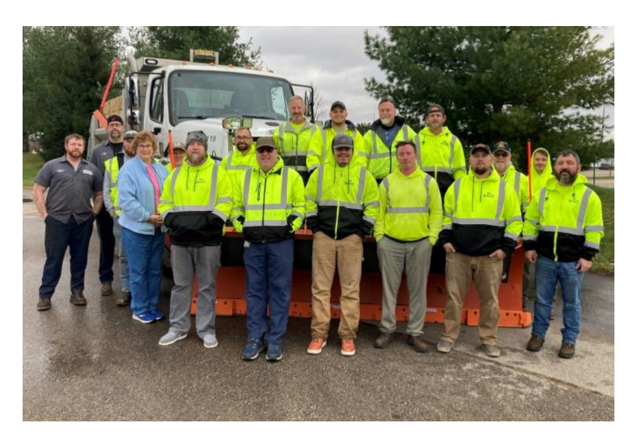
Department of Public Works 2023-24 snow removal crew.

Provide high quality infrastructure and connectivity; including roads, bridges, streets, sidewalks, bike paths and fiber optics, as well as water, wastewater, storm water and solid waste services. Maintain city facilities and plan for future needs.