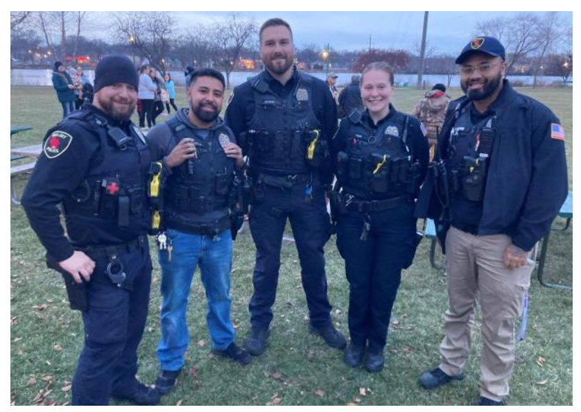
The City of Beloit Police Department held a successful Heroes Holiday event with Community Action, serving hundreds of Beloit children

Create and sustain safe and healthy neighborhoods by reducing crime, fear, and disorder through community collaboration, community revitalization, and ensuring public safety and economic security using honorable and progressive methods.