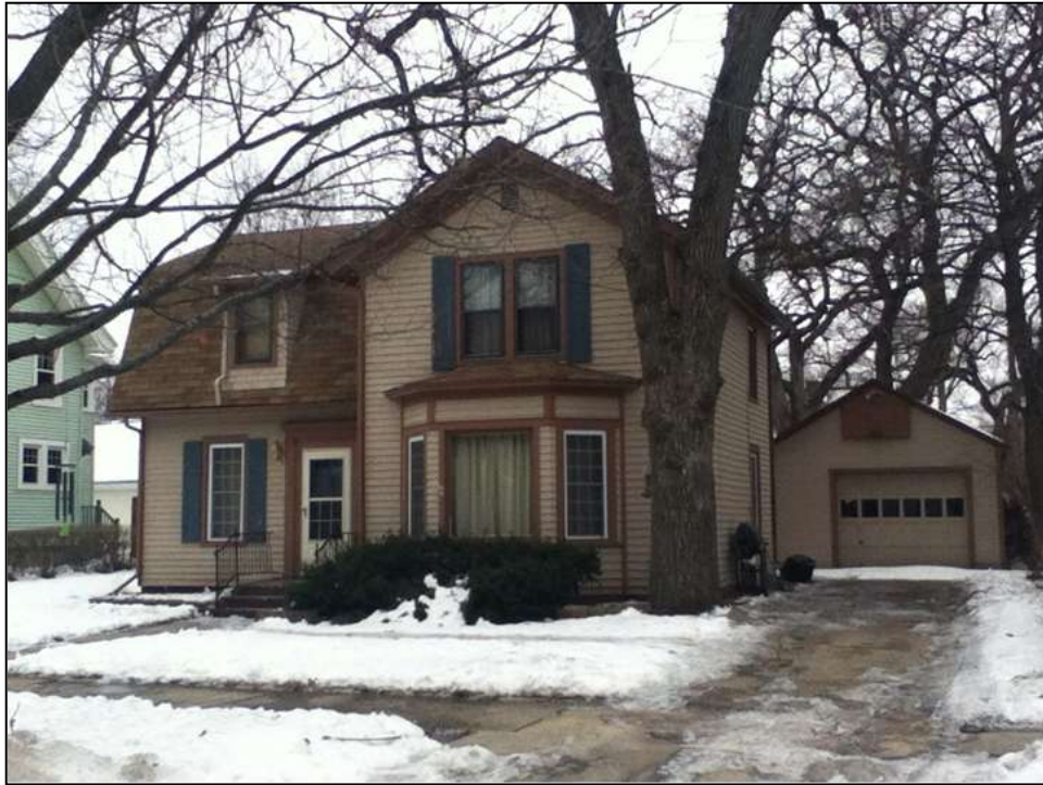
Front View of Historic House