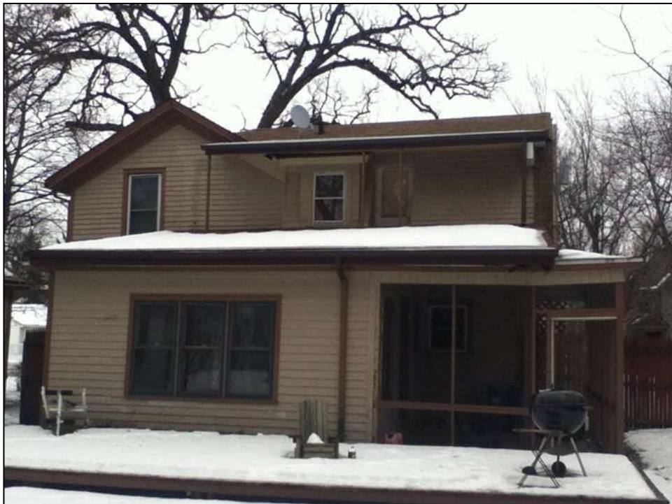
Rear View of Historic House