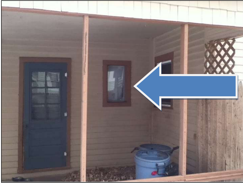
Window to Be Replace on Southwest Side of Historic House