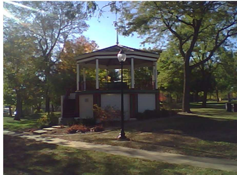
2010: Horace White Park landscaping and lighting upgraded