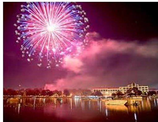
4 th of July celebration