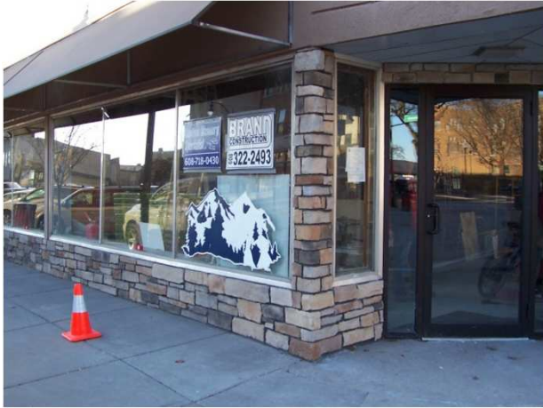
2012: Rivals Sports Bar renovation