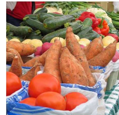
Downtown Farmers Market