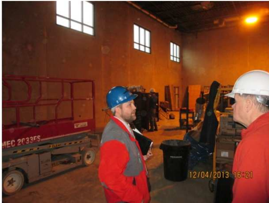
New gym at Gaston

2013: Additions, renovations and reconstruction of several Beloit District Schools, as part of a $70M building modernization program.