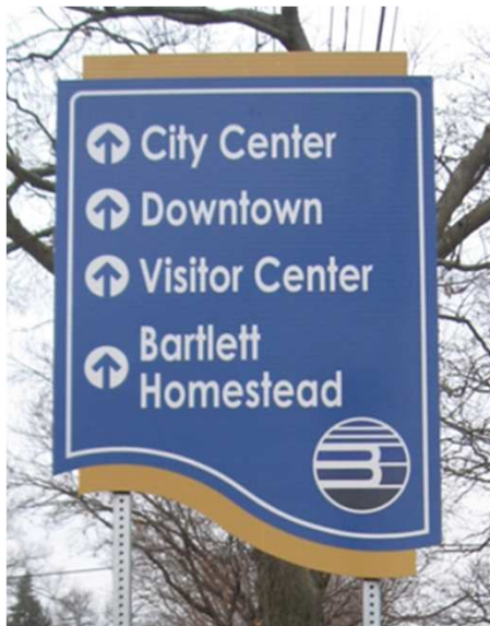
2010: Wayfinding signs updated and replaced