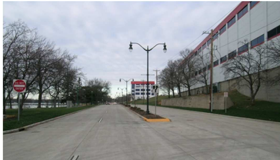
2010: Riverside Drive/Hwy. 51 reconstruction