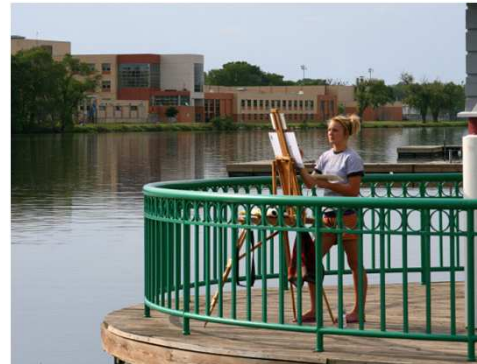
Plein Air Art Event