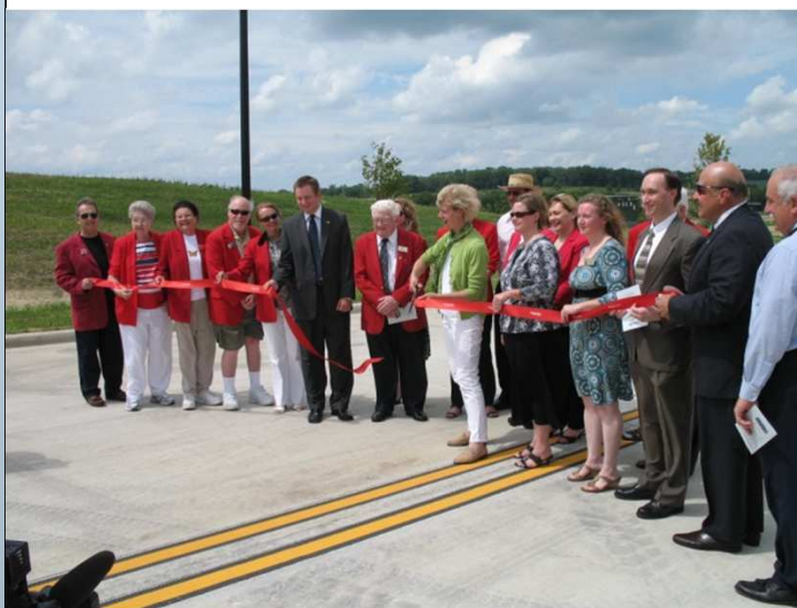
2009: Gateway Boulevard Extension