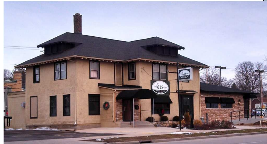
2012: 615 Club – Breaks ground for a 1,500 sq. ft addition