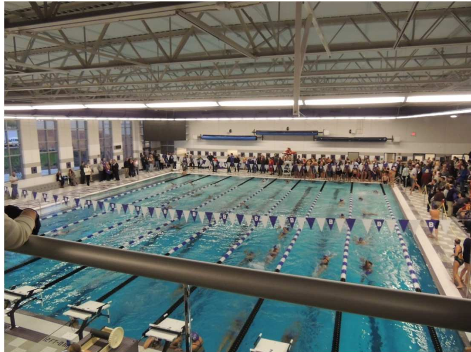
Beloit Memorial High School Natatorium