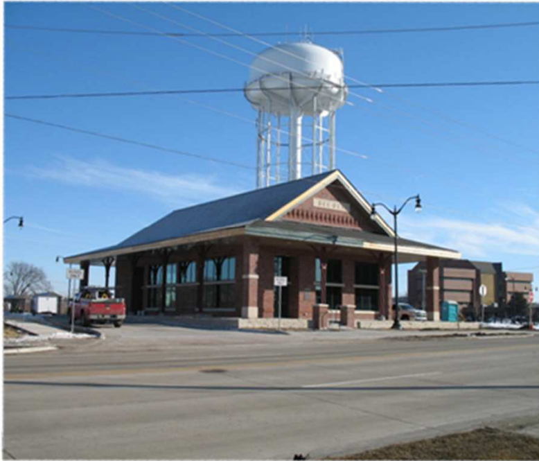
2010: Transit Transfer Facility