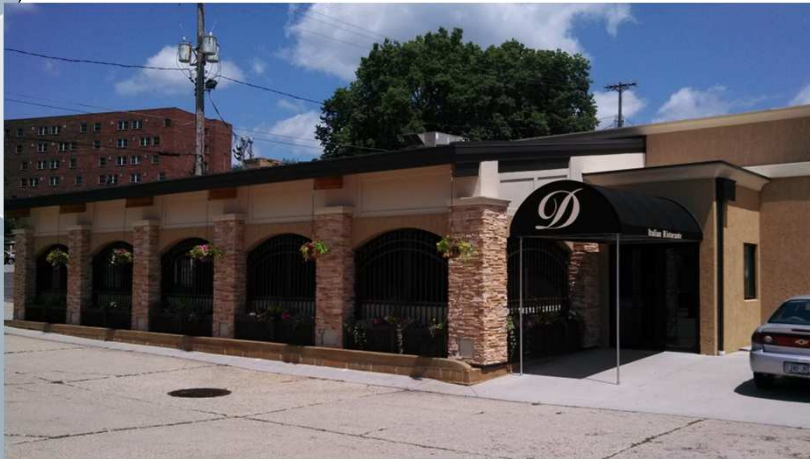
Domenico's Restaurant adds outdoor seating