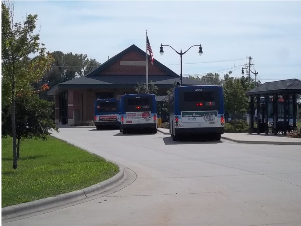
Beloit Transit System (BTS) Transfer Facility built in 2010. A Transit Development Plan is underway in 2014 and is proposed to be completed in 2015. See Work Plan Element 500 for more information.

2015 UNIFIED PLANNING WORK PROGRAM (UPWP) NOVEMBER 10, 2014