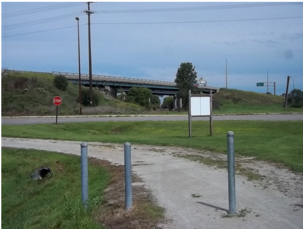
View of future Stone Bridge Trail Extension north at Rockton Road. Comprehensive non-motorized plan update planned in 2017.