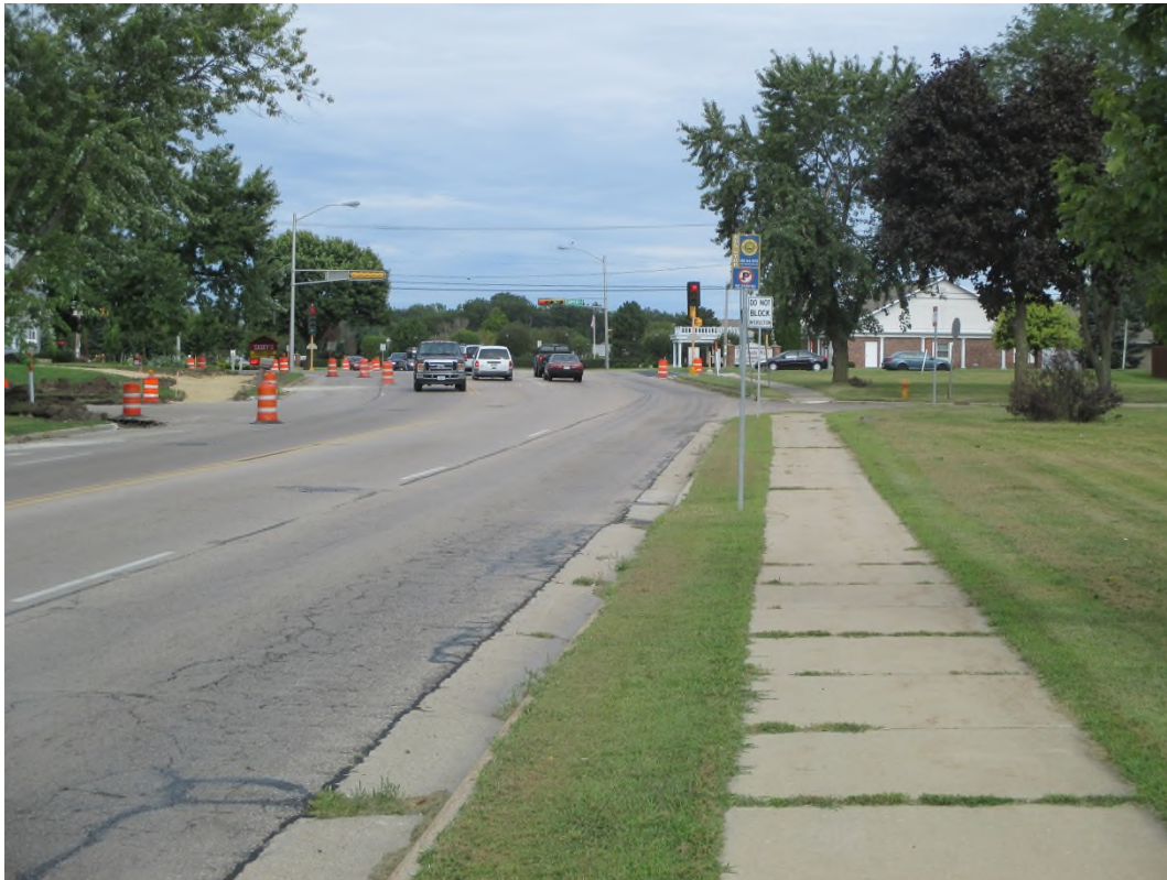
View of Cranston Road (intersection with Shopiere Road in distance). Corridor study plan planned in 2018.