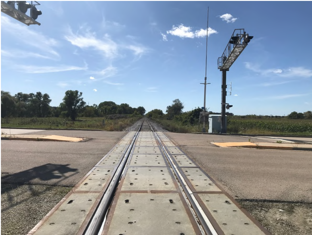
Union Pacific Railroad at Gateway Boulevard looking west. SLATS MPO Rail Study, planned to begin in 2020.