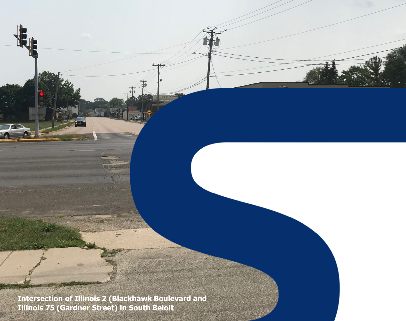
Intersection of Illinois 2 (Blackhawk Boulevard and Illinois 75 (Gardner Street) in South Beloit