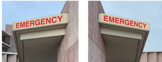
2 signs installed in proposed locations as shown